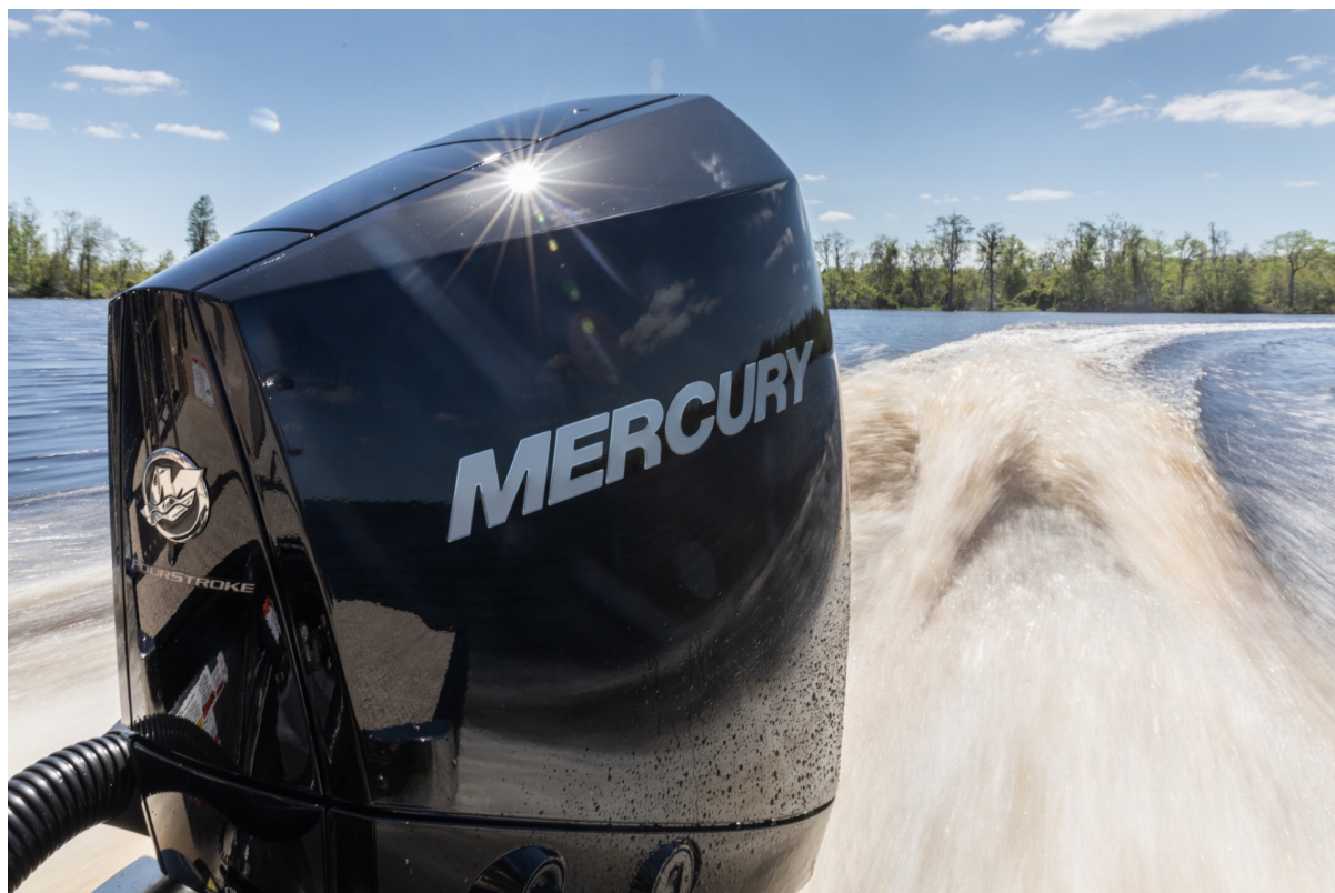
250 HP Verado