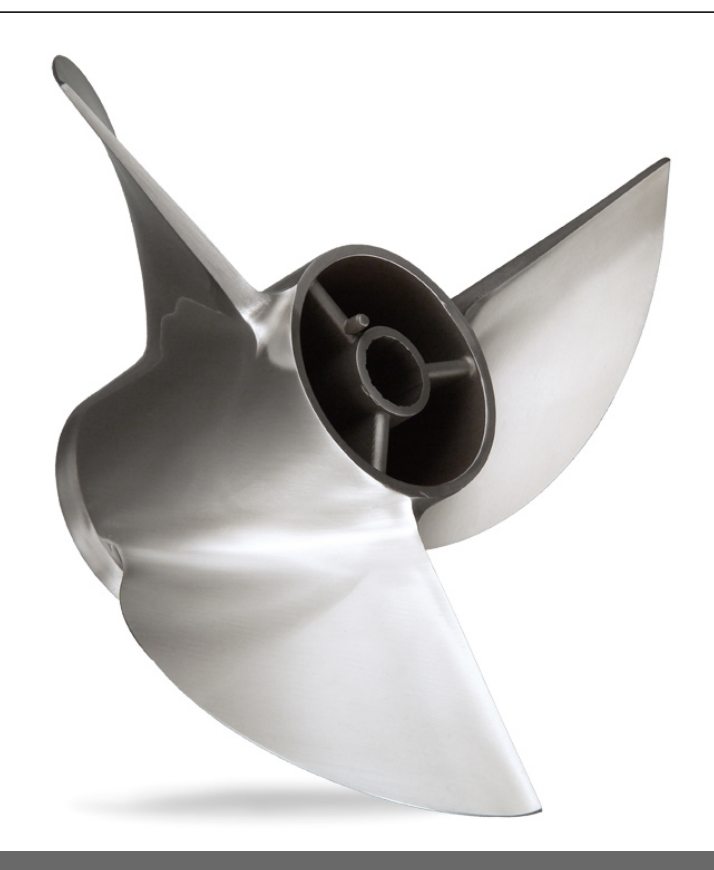
Mercury T.E. Cleaver Outboard Propeller